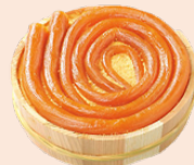
Minced Moriguchi Zuke Pickles