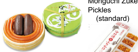
Moriguchi Zuke Pickles (standard)

Japanese seasoning of Moriguchi Zuke ※EXP : 90 days